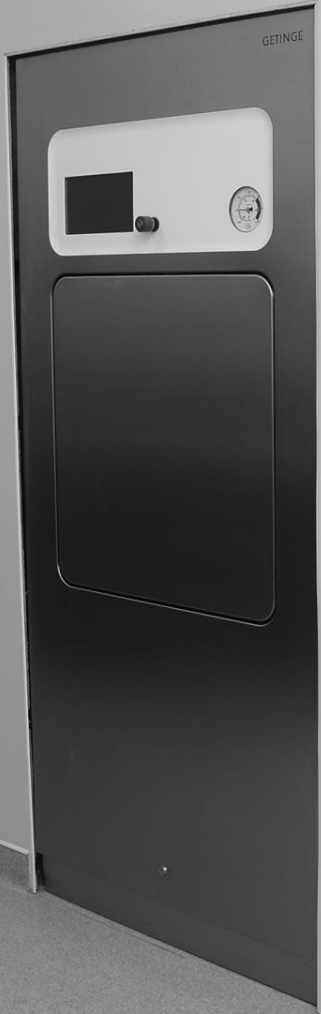
K Ultra in hospital CSSD